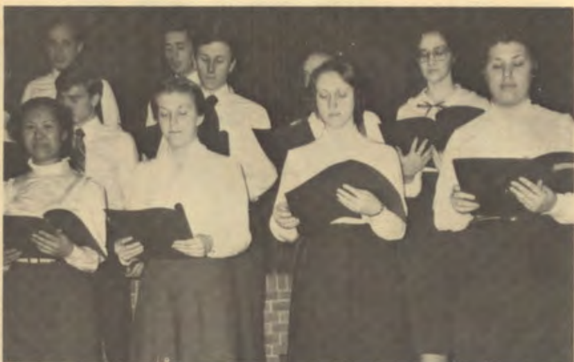
ator: T. Balke