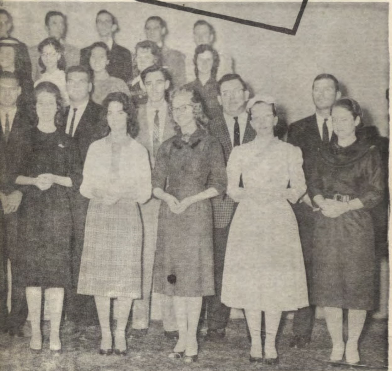
FRESHMAN CLASS OF A.B.I