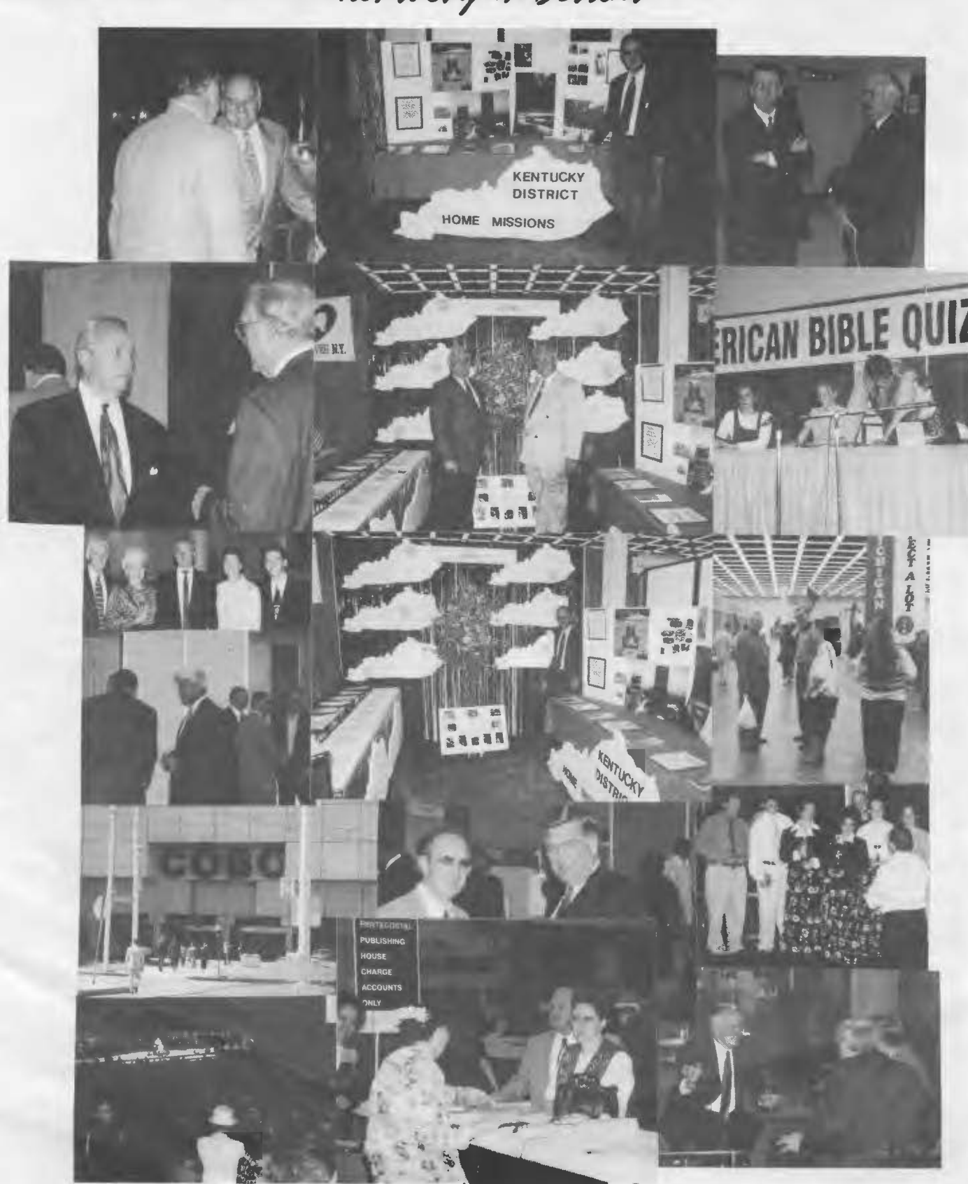
Kentucky District News * Page Four * October 1997