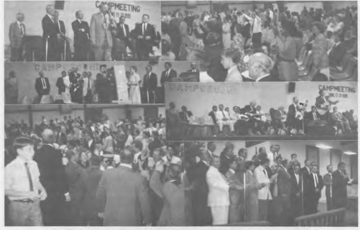
Kentucky District News * Page Six * August 1991

I appreciate the support of the District Board who helped guide the camp and every minister and saint who came.