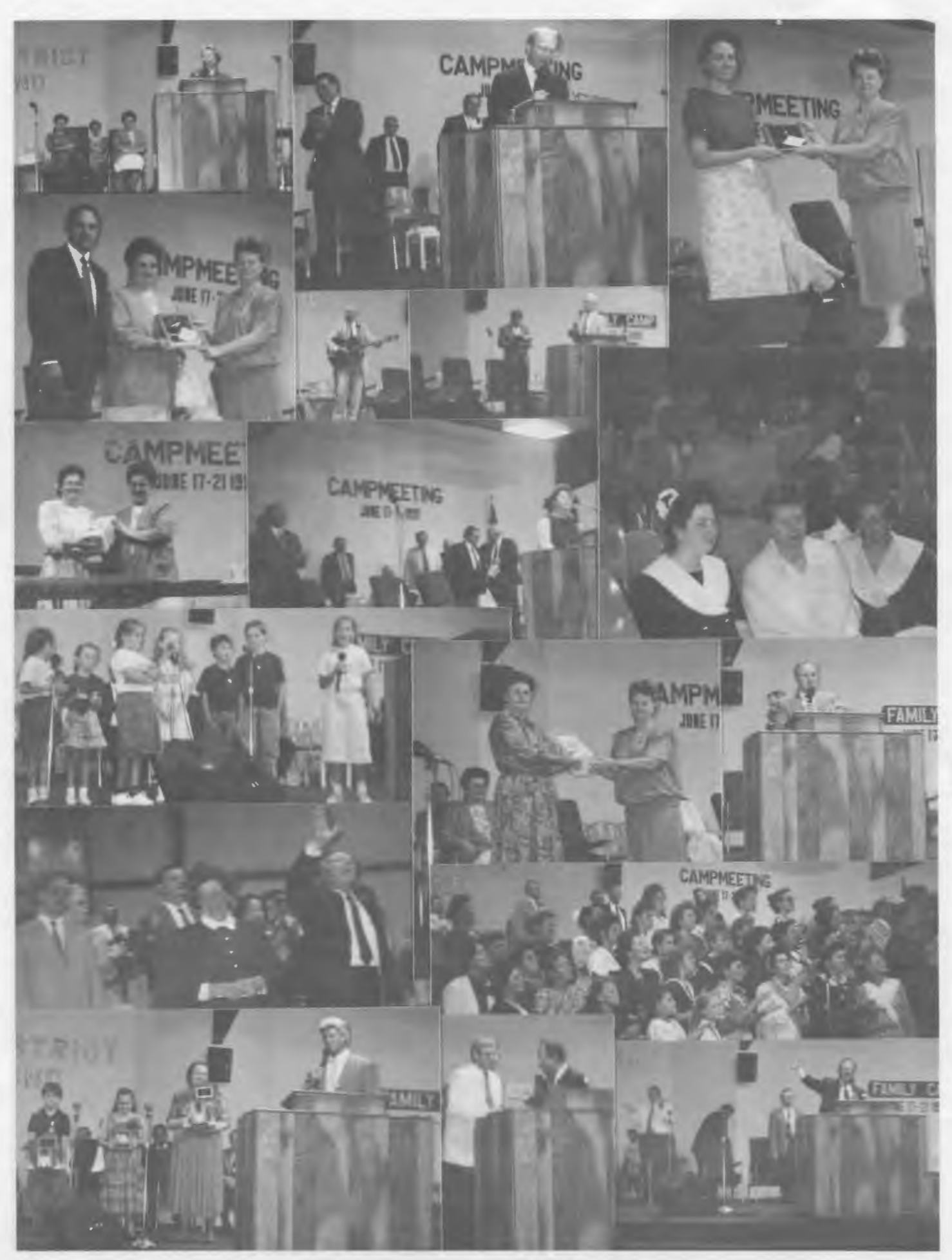
Kentucky District News * Page Eight * August 1991