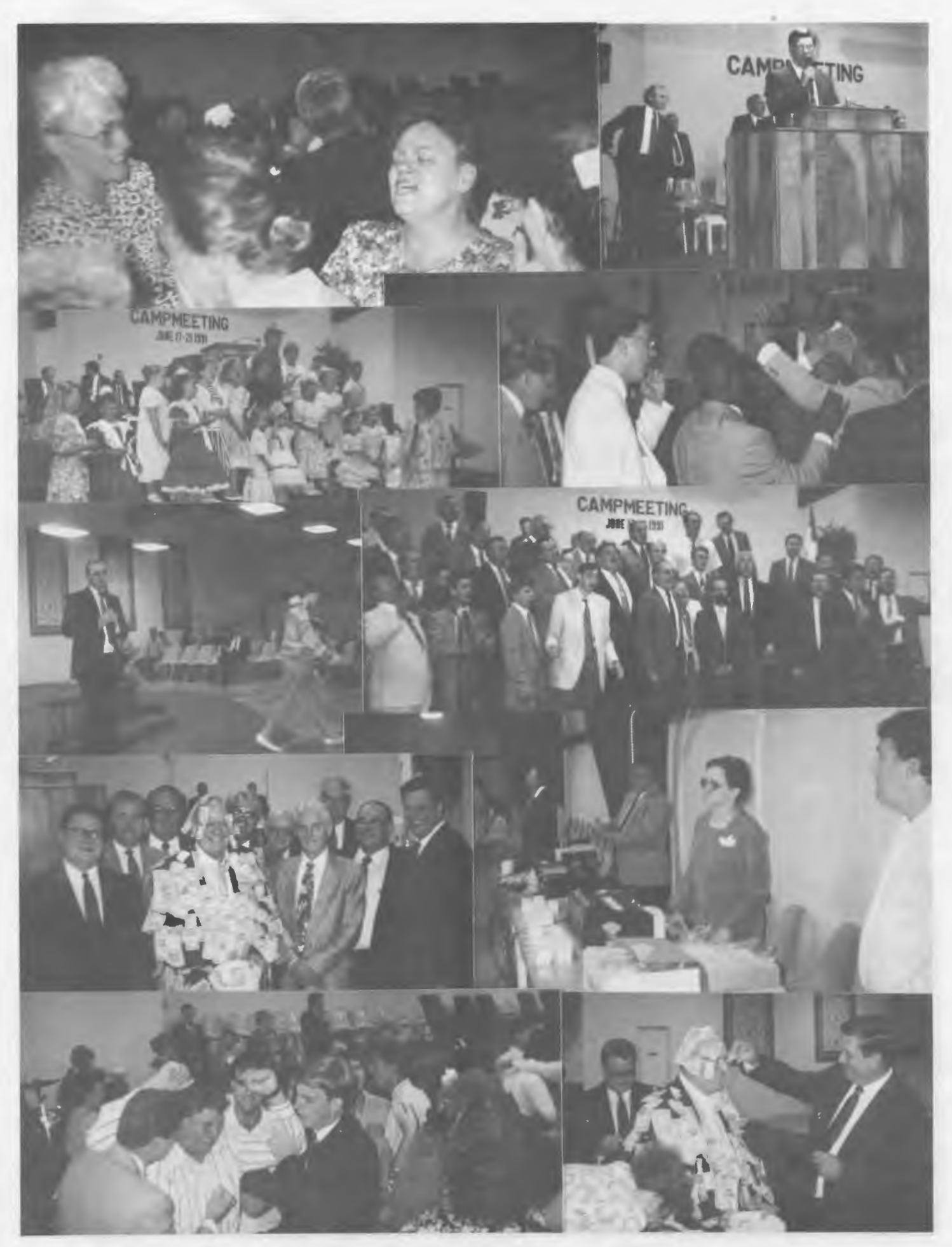
Kentucky District News * Page Seven * August 1991