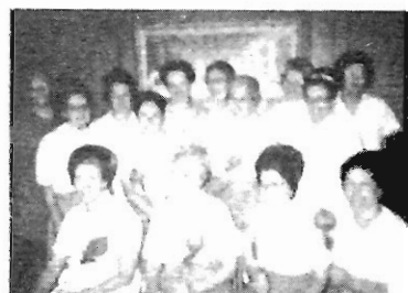
'72 Senior Camp Cooks & Dishwashers